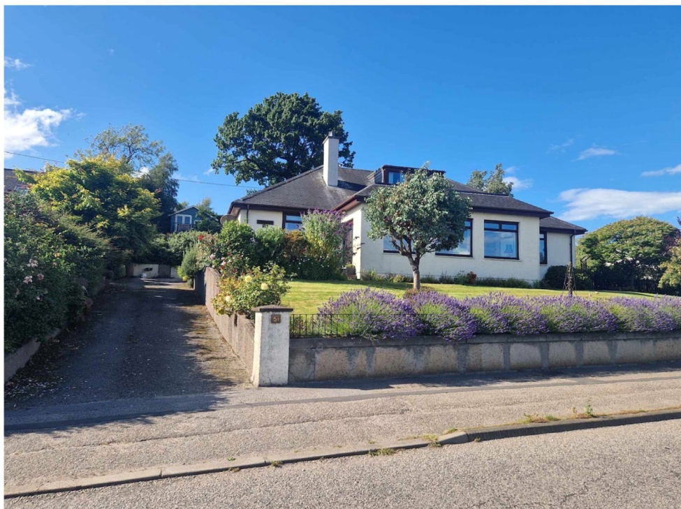
'CRAIGARD', 51 SALT BURN ROAD, INVERGORDON, ROSS-SHIRE, IV18 0HH

This spacious four/five bedroom detached property enjoys views to the front over the Cromarty Firth and the Black Isle beyond. It benefits from gas central heating, three en-suite bedrooms, driveway with ample parking for several vehicles and two garages. Viewing is highly recommended to fully appreciate the views enjoyed from the front and also from the elevated garden to the rear.