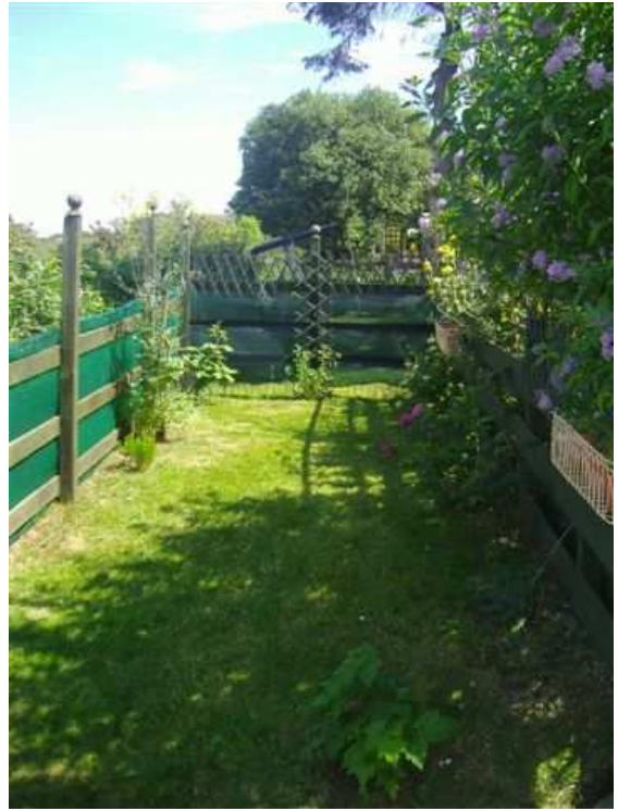
View from the rear of the property